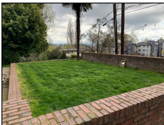
Spring rains have nourished the newly planted grass in the front yard of the Chapter House.

The old house is definitely showing her age, especially next to the brand new $12,000,000 renovation of the Alpha Delta Phi house next door.