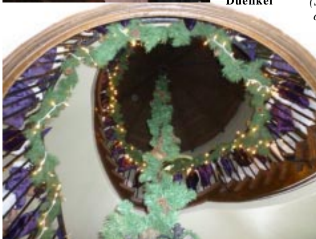
Stockings on the Stairs: A Parents' Group tradition since 1998