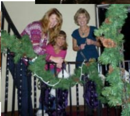
Bringing Christmas to the Chapter House